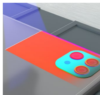
Generates high-resolution 3D data