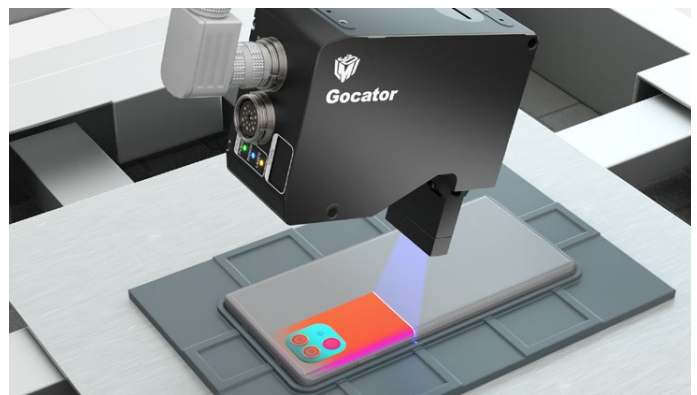
Gocator® 2522 scanning cell phone cover glass assembly

The sensor's laser projection technology can handle a wider range of surface angles, material types, and surface colors. Competing laser profilers use a collimated laser beam that does not offer the same target angle performance.